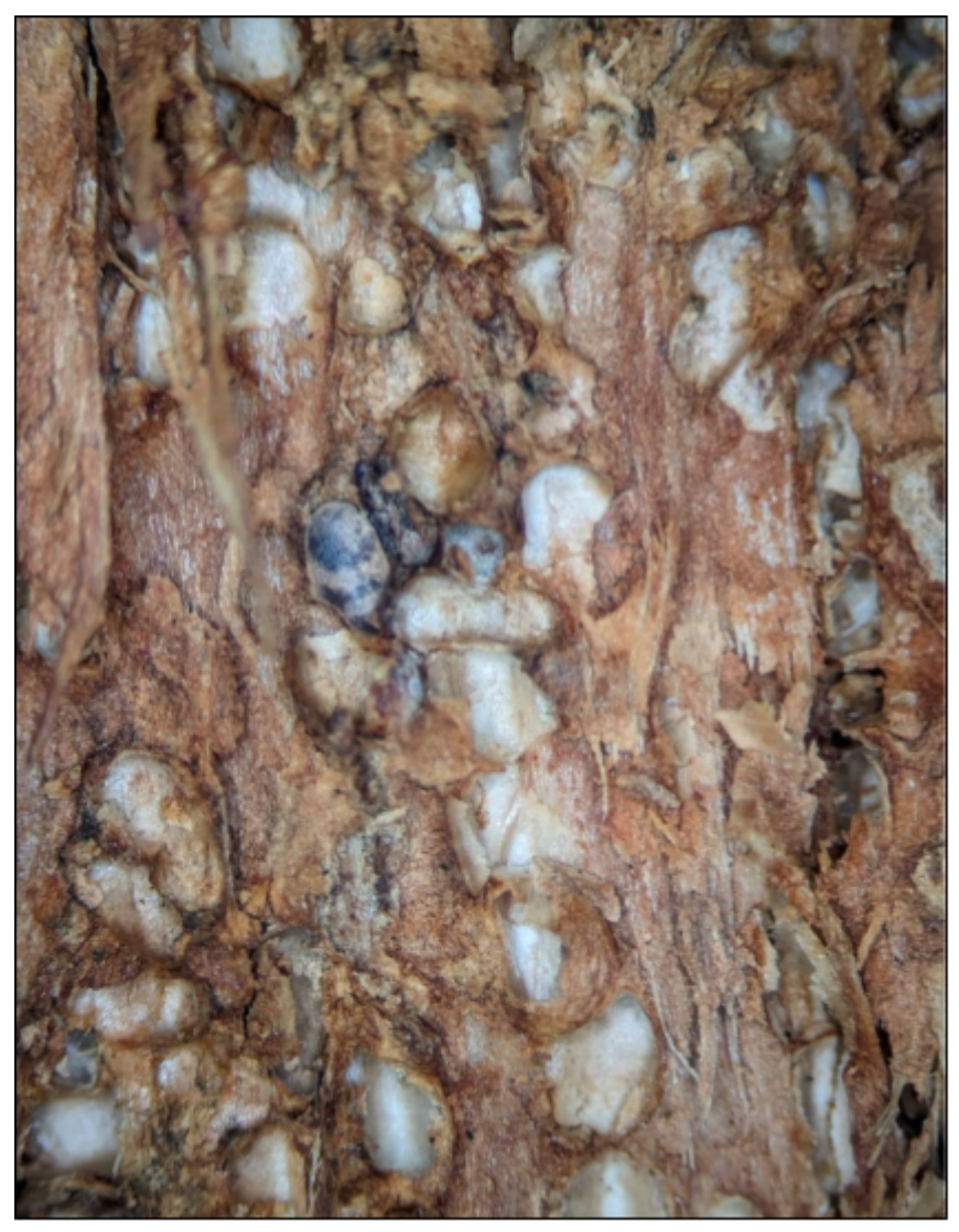
Figure 3. Pits found under bark damage at 6.6x magnification.

The next phase of this investigation will include identifying associated insects and birds using netting and potentially wildlife cameras.