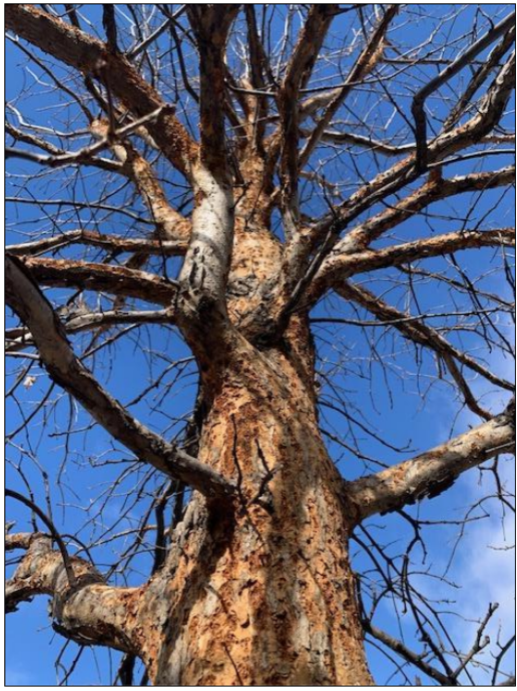
Figure 4.Bark damage on swamp white oak.

Written by: Stephanie Adams, PhD, ISA BCMA, Plant Health Care Leader, The Morton Arboretum March 20, 2024 <u>https://acorn.mortonarb.org/Detail/objects/134384</u>