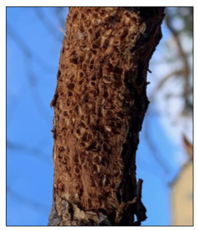
Figure 2. Bark damage on swamp white oak.

Symptoms: The outer bark of the trees has been pulled up in strips or pulled off of the tree. This bark peeling does not extend into the cork cambium layer. In the areas where the bark was peeled and removed, there are pits in the cork cambium layer (Figure 3). The pits look like someone took a tiny melon-baller and scooped out part of the cork cambium. Inside the holes are clean, they are not discolored, and no fungi are associated with them.