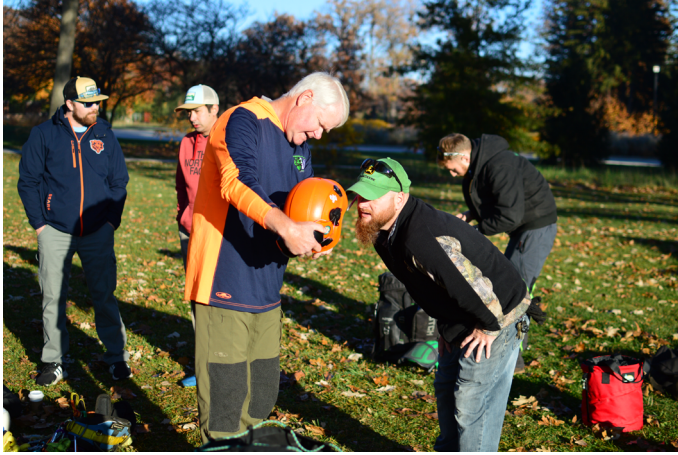
Climbing Championship climbers.