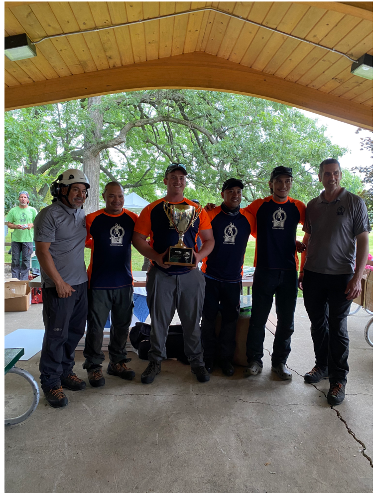
Corporate Cup Winners: Kramer Tree Specialists

The IAA would like to thank our sponsors,