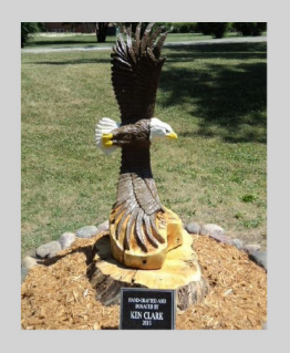
Wood Carver/ Sculptures on site!

IL Tree Climbing Competition Come out and see some of Illinois' best tree climbers compete to be the best of Illinois and go on to compete against international climbers!