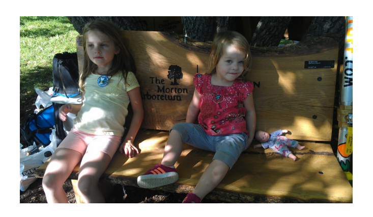
(continued on page 9

So this tree has seen a lot, as most have, and that is something that many people I talk to don't really consider. Yes trees are old, and they have been around for a long time, but many people don't fully see that all trees, whether small or big, tall or squat, young or old tell a story. I have the pleasure of working at The Morton Arboretum and it is not just a walk in the woods, but it is a place where trees speak, they tell a story in their rings of the past and show what use to be. I think this is one of the great un-grasped treasures that nature and trees have to offer a society overwhelmed by technology. Nature is simple and yet utterly complex and that is where the beauty is. My woodworking company, Hardwood Solutions: a division of S.A.W. Inc. is seeking to grasp that beauty, and bring it to life in its entire splendor. Our goal, as a company, is to embody what Aristotle said about art, "The aim of art is to represent not the outward appearance of things, but their inward significance". Hopefully we were able to bring to life the beauty and the story this eighty five year old oak tree has told into a practical piece of furniture that will last for generations.